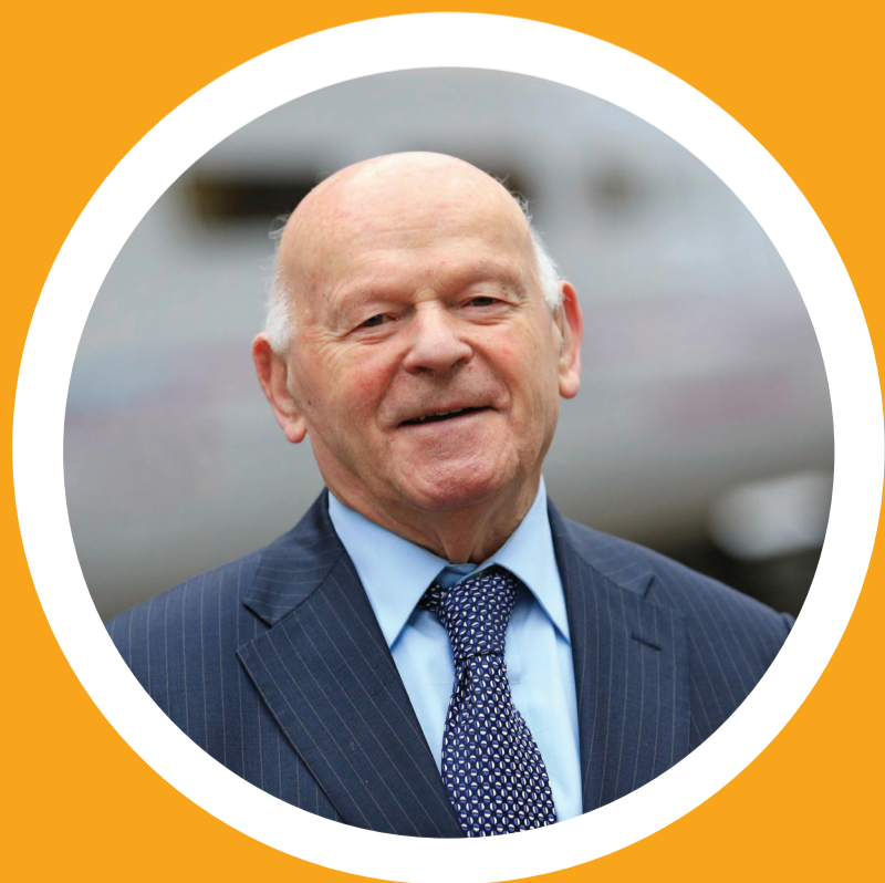
Image: Auschwitz

'I was there. As a child aged nine I was in the ghetto. Aged 15 I was in the concentration camp. We must tell people what happened. No child should go through what I did.'