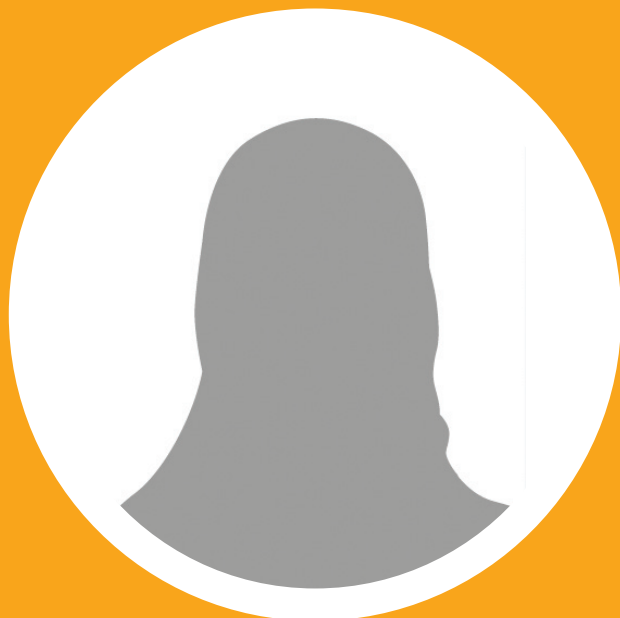
Faiza, survivor of the Genocide in Darfur

Image: Um Ziefa burning village